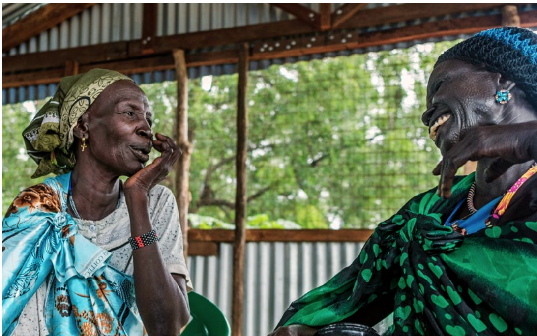
Women's Peace Committee in Pibor, South Sudan.