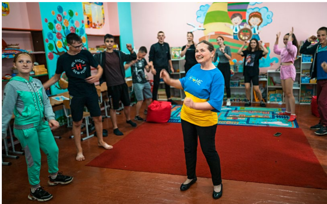
Summer clubs supported by FCA brought children and youth together in Chernihiv, Ukraine during July and August 2022. The clubs provided valuable psychosocial support to a war-affected population.