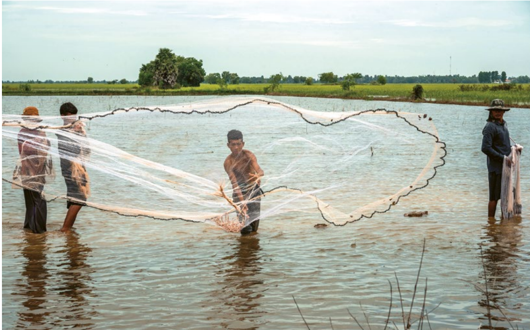
A majority of Cambodia's people live in rural areas, earning their livelihood from small-scale farming, fishing, casual work or micro-enterprises.