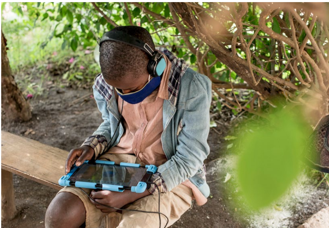
Students in Kyaka II refugee settlement accessed tablets to continue their education while many classes remained closed due to the Covid-19 pandemic.