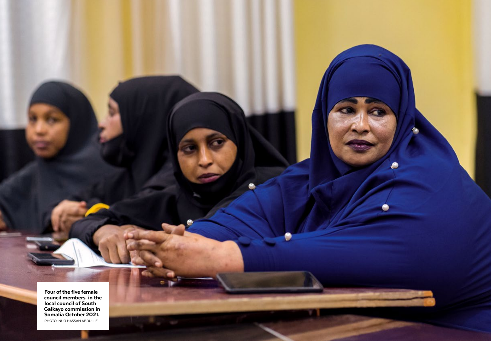
Four of the five female council members in the local council of South Galkayo commission in Somalia October 2021.