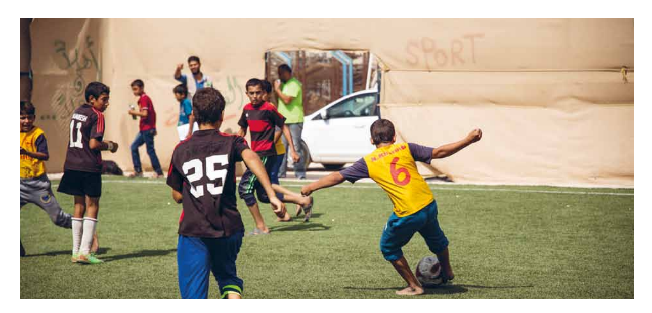
Youth soccer game at the Za'atari refugee camp in Jordan. Then turf was laid near FCA's office.

In education this means for instance that children and youth have (more) friends, they join activities, clubs and teams, teachers are able to collaborate with colleagues and extend the collaboration to parents and other community members. For parents and other community members this can mean taking responsibilities and committing to work for other community members.