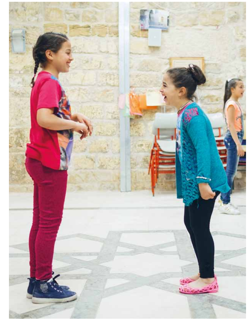
The Big Brother, Big Sister programme offers positive role models for marginalized children and helps to build their confidence.

At the beginning of the project, the volunteers met the children's parents in order to explain the