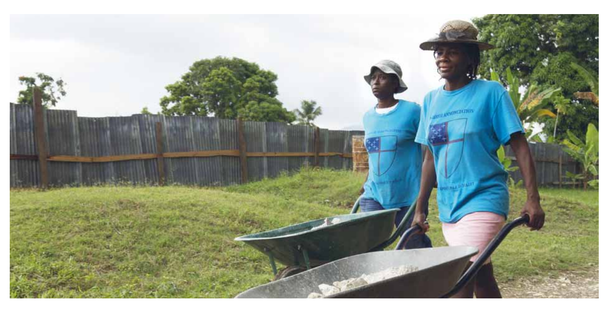
Mothers reconstructing a school in Haiti after the destructive earthquake in 2010.

Starting outreach activities with community members as soon as possible after an emergency ensures that children and youth can return to school. Examples include "Back to School," "Everybody to School" and "Stay in School" campaigns. Existing mechanisms and key stakeholders (social workers, teachers, CBO staff, and community volunteers) should be drawn upon to initiate and lead the outreach; teachers are often looking for "missing out" children after an emergency. Data on who are excluded from education can be obtained through