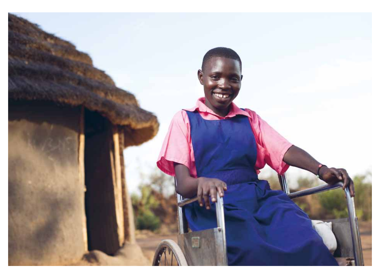
South Sudanese refugee girl at Adjumani camp in Uganda.