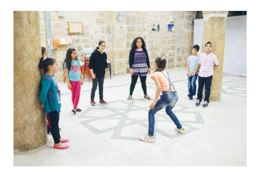
Children participating in the Big Brother, Big Sister programme.

aims of the project and to get their support. The volunteers discussed children's personality traits and interests as well as assessed their living conditions. This helped in developing an individual plan for each child. Each parent also gave a written consent to allow the children to participate in the project.