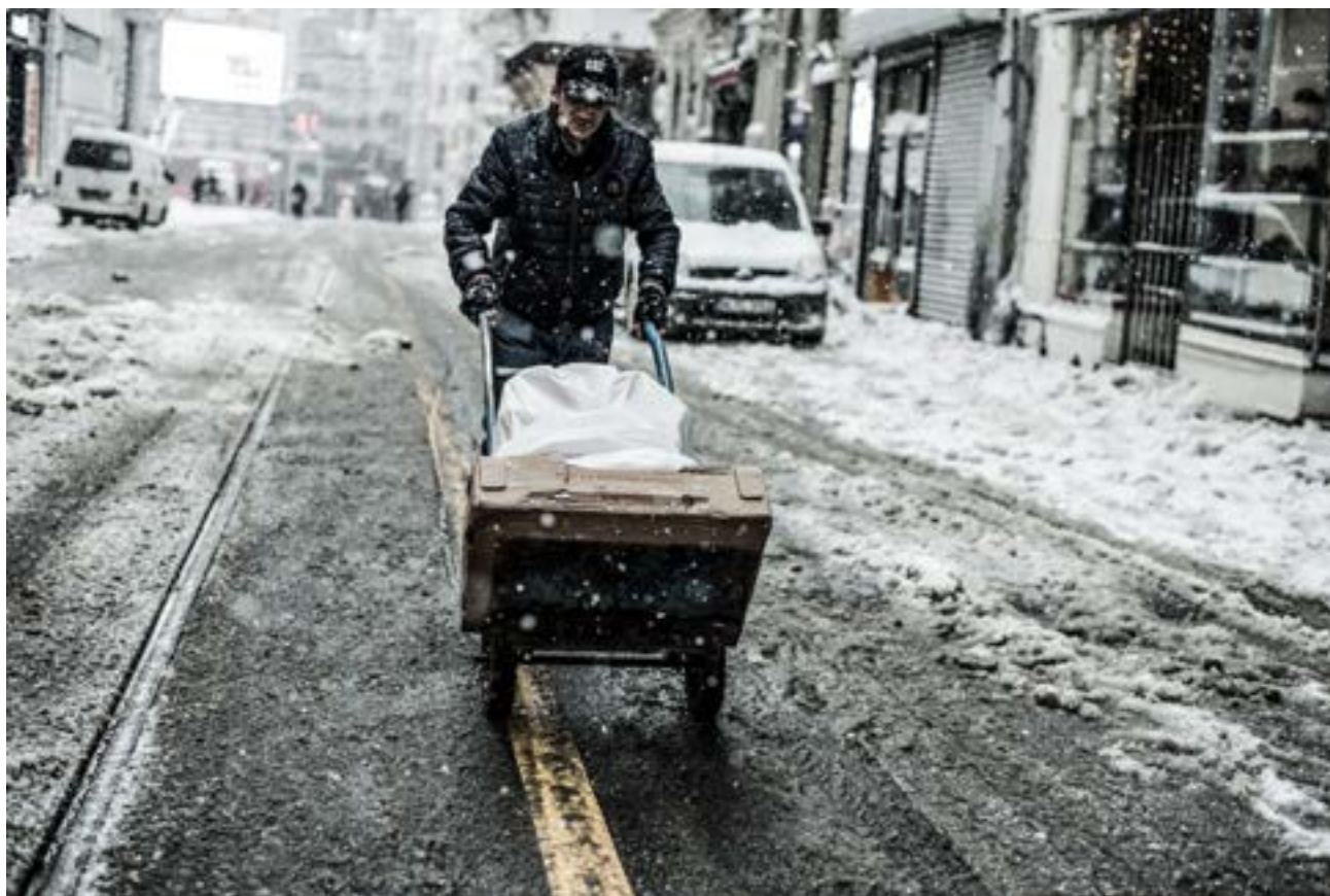
Syrian refugee working in Istanbul, Turkey. January 2017.

In comparison to the funds pledged and or committed to Turkey at the London Conference and through the EU-initiated Facility for Refugees in Turkey, Turkey has spent approximately $25bn of its own fiscal resources on the refugee response. 42