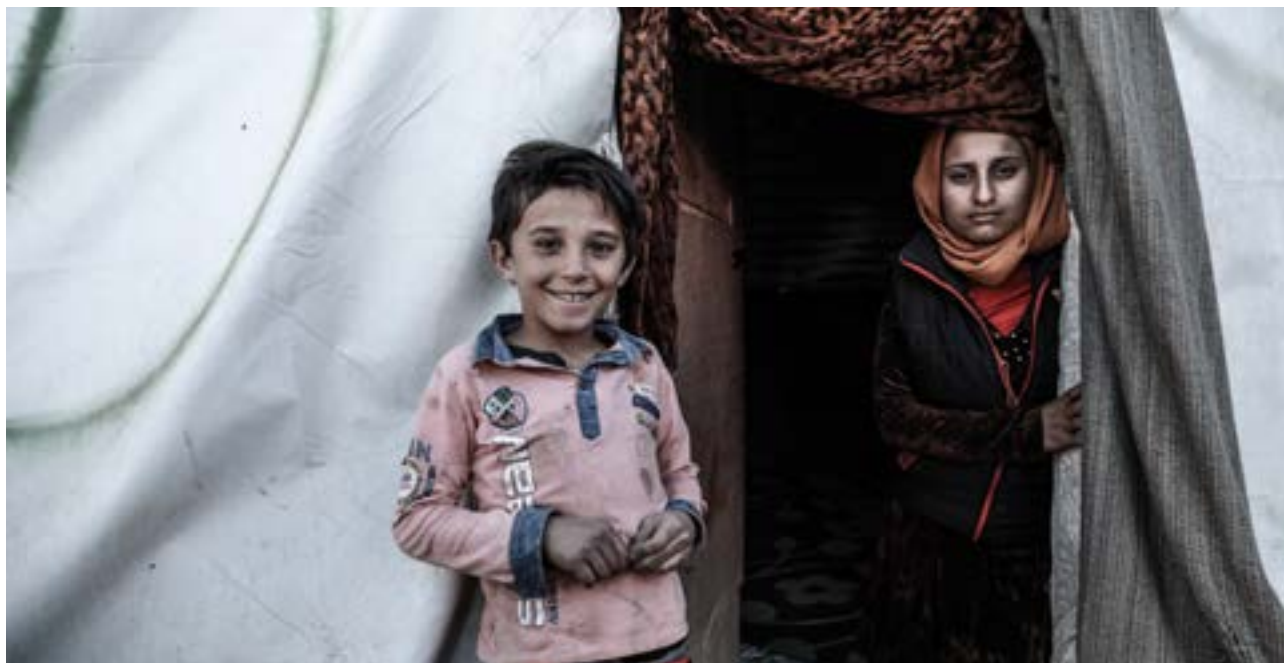
Mother and her boy in an ITS in Zahle, Lebanon. January 2017.

The adoption of the EU-Lebanon Compact, which foresees an EU allocation of at least €400million in 2016-17, in addition to bilateral assistance of more than €80million, was announced on 15 November 2016. In addition to financial commitments, the EU has also committed to increase support to private sector development in Lebanon, provide assistance to help Lebanese businesses take advantage of existing market access to the EU, and seek to reduce existing non-tariff barriers to goods and services.